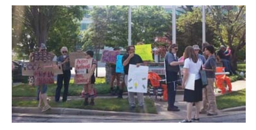
Protest at CCA's 2016 annual meeting