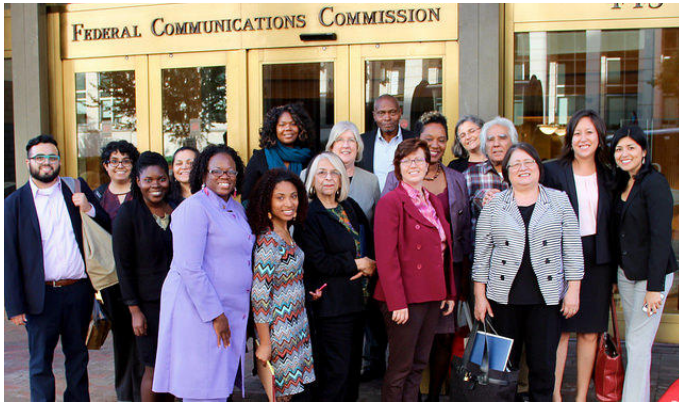
Phone Justice delegation to the FCC, Oct. 2015